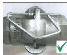
Air hose coupling WITH safety pins