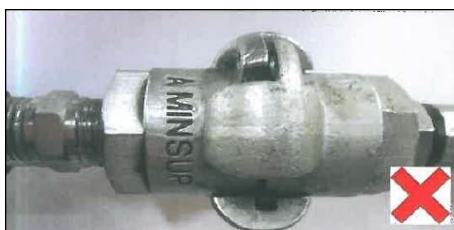
Air hose coupling WITHOUT safety pins