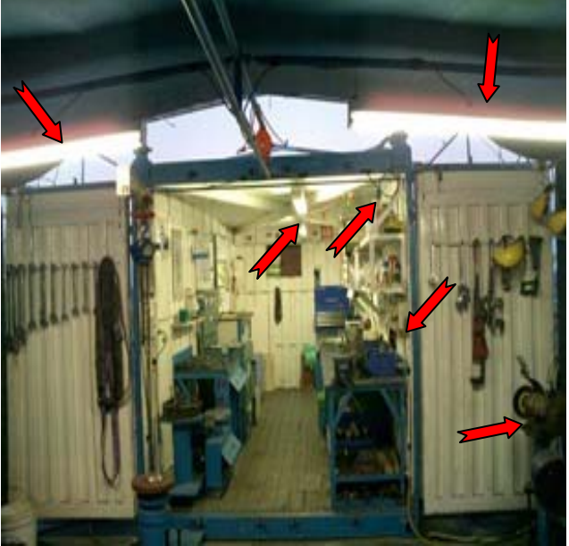
Non-Ex electrical fittings are as indicated