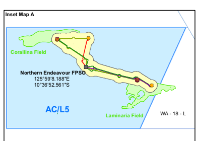
Figure 1: Location map for Laminaria- Corallina fields and North Endeavour FPSC