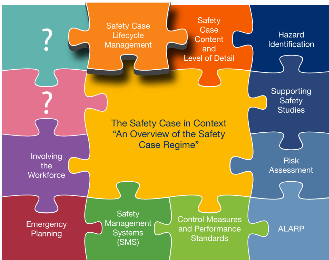
Figure 1 – Safety Case Guidance Note Map

Figure 1 illustrates the scope of the NOPSEMA safety case guidance notes overall, and their inter-related nature. The guidance notes are available on the NOPSEMA website, along with guidance on other legislative requirements such as nomination of operators, validation, and notifying and reporting accidents and dangerous occurrences.