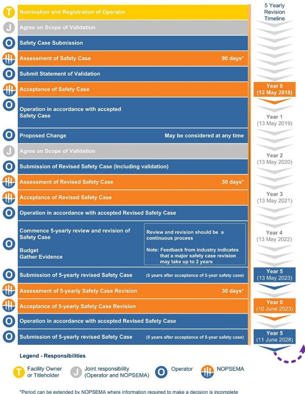
Figure 3 – Review and Revision Timeline (Example)

The following diagram provides a suggested example of when an operator should consider commencing review and revision of their safety case for the purposes of a five-year submission and acceptance. The five (5) yearly revision timeline highlights the initial trigger (5 years after acceptance of initial safety case) and subsequent triggers (5 years after acceptance of 5-yearly safety case revisions) for submission of five yearly revisions.